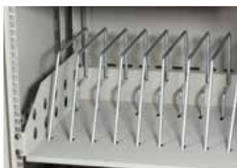
Rackmounted shelf with rolled stainless steel device slots that help prevent scratches.