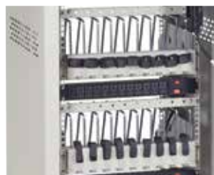
Two-piece cable managers open easily for fast cable routing.