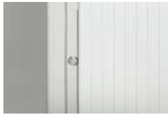
Sliding, "pinchless" door saves space.