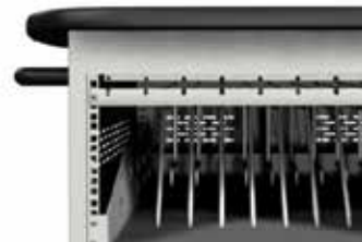
Two-piece cable managers open easily for fast cable routing.