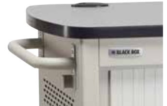
Durable push/pull bar and power cord wrap.