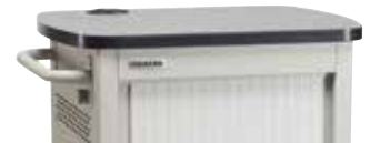
Laminate top provides extra working space.