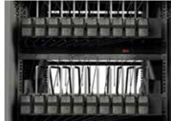
Power brick lacing stores power bricks easily and neatly (medium- and large-shelf models only).