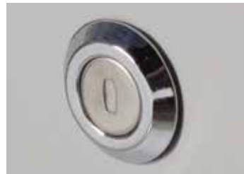
Locking front door and rear access panel.