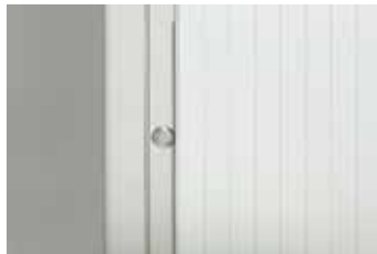
Sliding, "pinchless" door saves space.