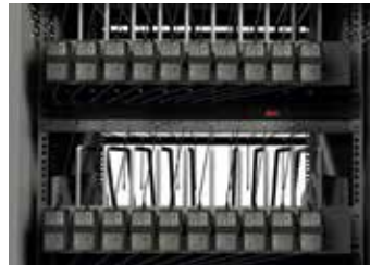
Power brick lacing stores power bricks easily and neatly (medium- and large-shelf models only).