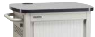
Laminate top provides extra working space.