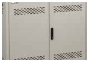
Hinged door with handle.