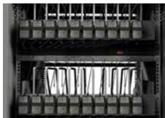
Power brick lacing stores power bricks easily and neatly (medium- and large-shelf models only).