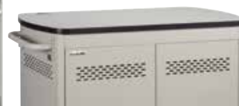
Laminate top provides extra working space.