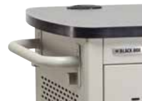
Durable push/pull bar and power cord wrap.