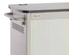
Durable push/pull bar and power cord wrap.