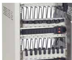
Two-piece cable managers open easily for fast cable routing.