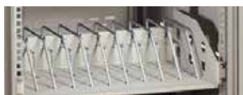
Rackmounted shelf with rolled stainless steel device slots that help prevent scratches.