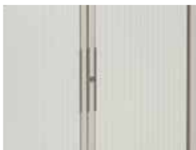
Sliding door with handle.