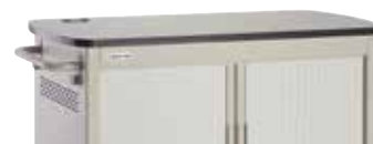
Laminate top provides extra working space.