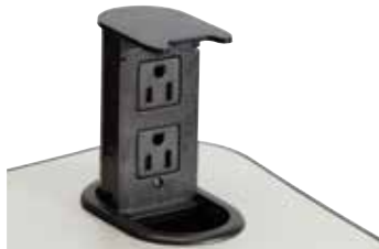
Optional integrated pop-up power port for maximum safety.