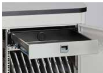
Optional drawers and shelves available.