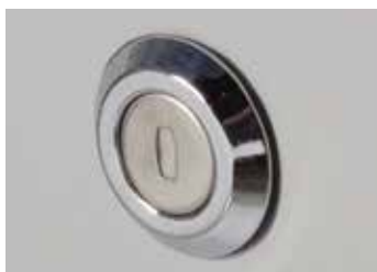
Locking rear access panel.