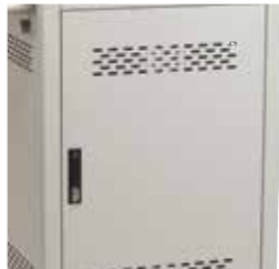
Hinged door with handle.