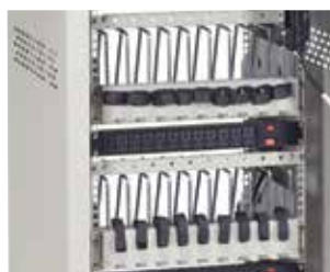
Two-piece cable managers open easily for fast cable routing.