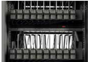
Power brick lacing stores power bricks easily and neatly (medium- and large-shelf models only).