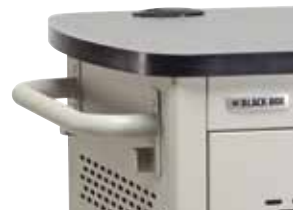
Durable push/pull bar and power cord wrap.