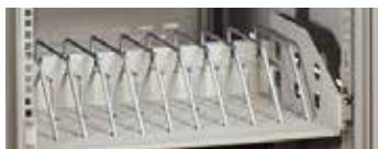
Rackmounted shelf with rolled stainless steel device slots that help prevent scratches.