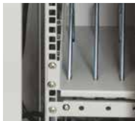
Standard rack mounting allows greater flexibility.