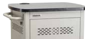
Laminate top provides extra working space.